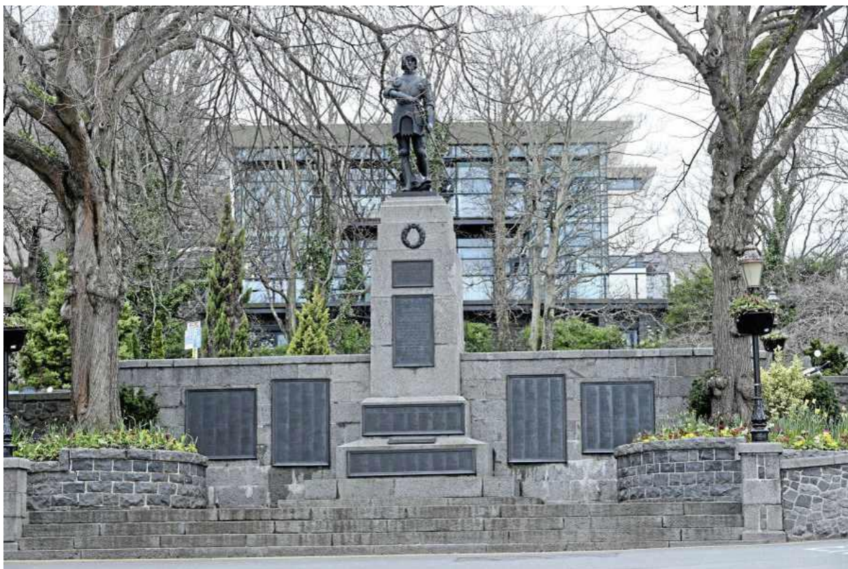
Bailiwick of Guernsey War Memorial