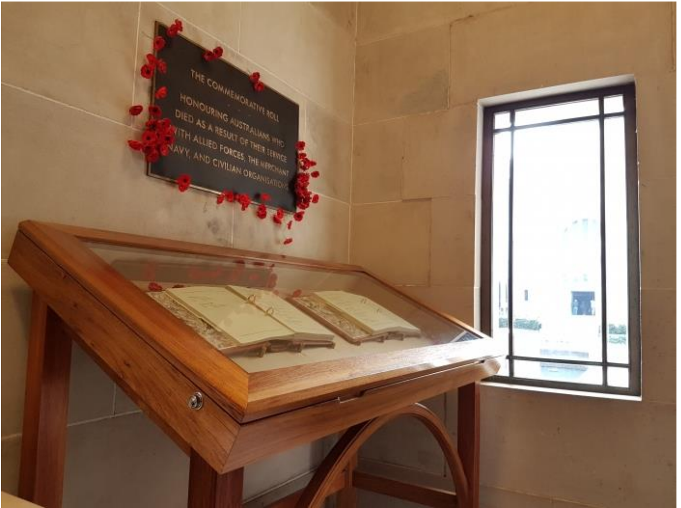
Commemorative Roll